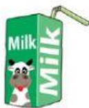
Unit 13 - 12