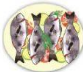
Unit 13 - 8