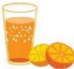
Unit 13 - 9