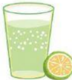
Unit 13 - 11