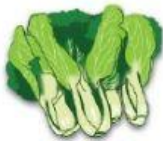
Unit 13 - 2