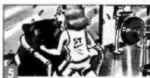
rarely / go to the gym