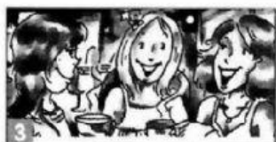
in the evening / usually / meet her friends for coffee