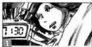
every day / get up / at half past seven