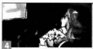
once a week / watch a film at the cinema