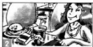
often / eat fast food for lunch