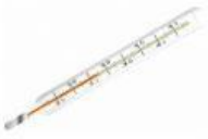
Thermometer with mercury

Match with a line if these materials are conductors or insulators: