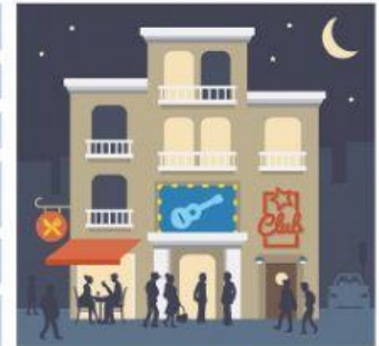
12 night _____

2 Complete sentences 1–12 with compound nouns from exercise 1. Use the plural form if necessary.