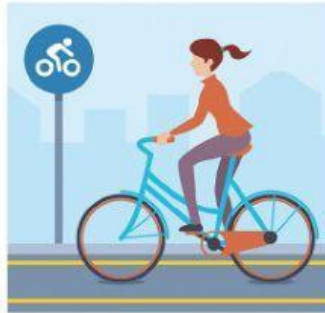
2 bike _____