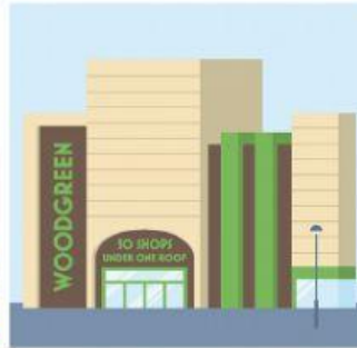
3 _____ mall