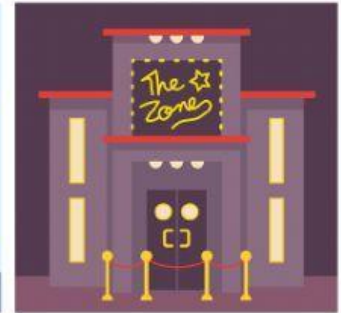
4 _____ club