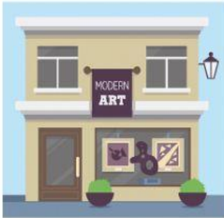
1 art _____

transportation pedestrian life gallery parking path department jam shopping night sports center