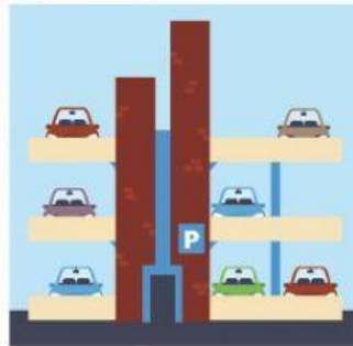
7 _____ lot