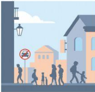
5 _____ area