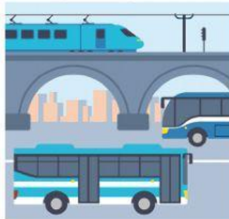
10 public _____