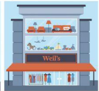
8 _____ store