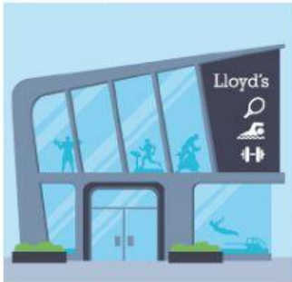
9 _____ center