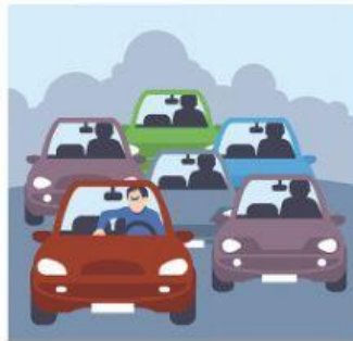
6 traffic _____