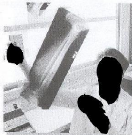
She's a doctor.