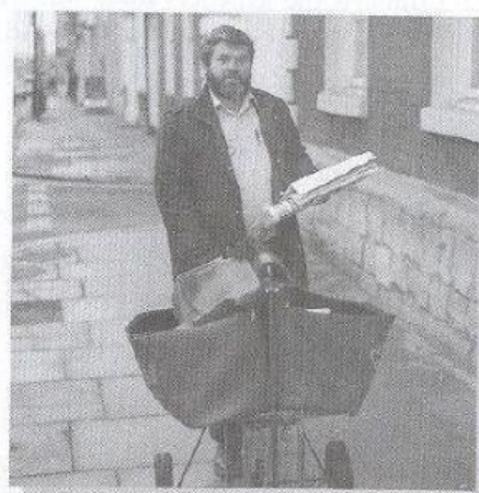
He's a postman.