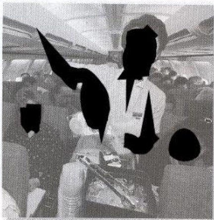
She's a flight attendant.

She wears a uniform. He works outside. She works in a hospital. He works in a hotel. She travels a lot. He walks a lot. She helps sick people. He answers the phone. She speaks three languages. She serves drinks. He speaks four languages. She works with nurses. He delivers letters. He works with a computer. He starts work at 5.00 a.m. She wears a white coat.