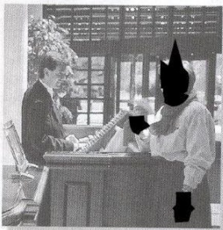
He's a receptionist.