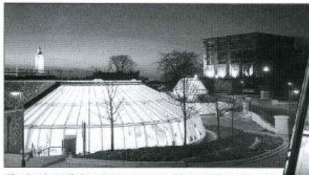
The Castle Mall shopping centre, seen from outside and inside

Now the city's attractions include another important development, a modern shopping centre called 'The Castle Mall'. The people of Norwich lived with a very large hole in the middle of their city for over two years, as builders dug up the main car park. Lorries moved nearly a million tons of earth so that the roof of the Mall could become a city centre park, with attractive water pools and hundreds of trees. But the local people are really pleased that the old open market remains, right in the heart of the city and next to the new development. Both areas continue to do good business, proving that Norwich has managed to mix the best of the old and the new.