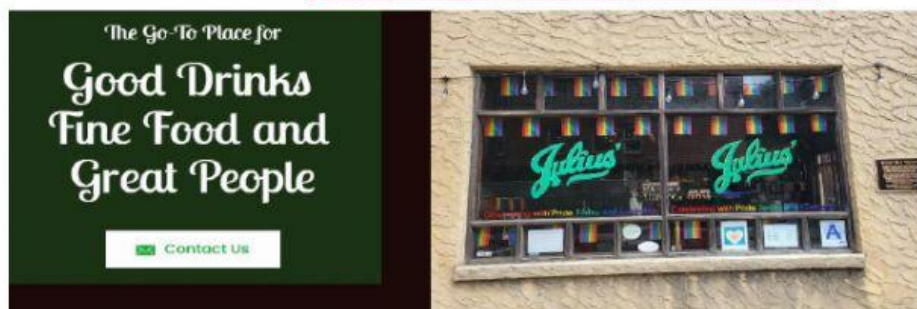
New York's oldest Gay bar and Greenwich Village's oldest bar.