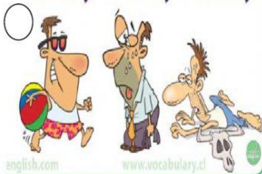
Sunday Monday Tuesday