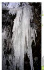
Falling water turned ice