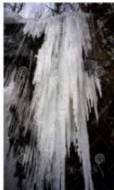
Falling water turned ice