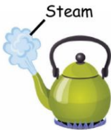
Steam from kettle