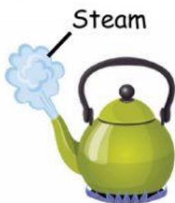
Steam from kettle