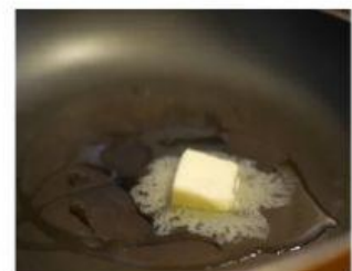
Butter heated in a pan