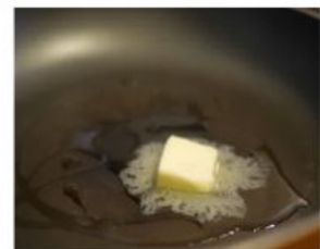
Butter heated in a pan