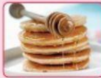
pancakes butter, eggs, milk, flour, honey