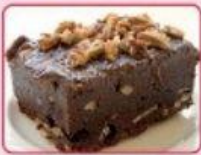
brownie chocolate, flour, eggs, butter, nuts, sugar