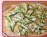
asparagus and cheese pizza flour, olive oil, salt, asparagus, cheese