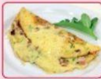
omelette butter, cheese, eggs, ham, salt