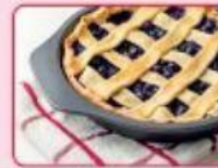
blueberry pie flour, blueberries, sugar, butter