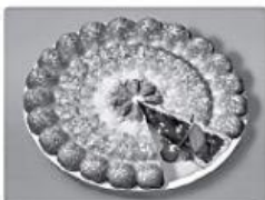
4 cherry _____