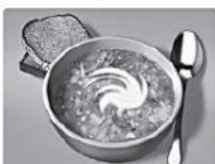
6 chicken _____