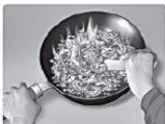
3 prawn _____