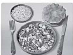
5 vegetable _____