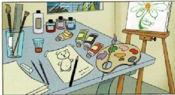
The New Art Class