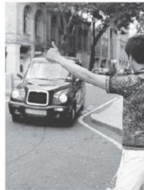
1 g _ _ a taxi