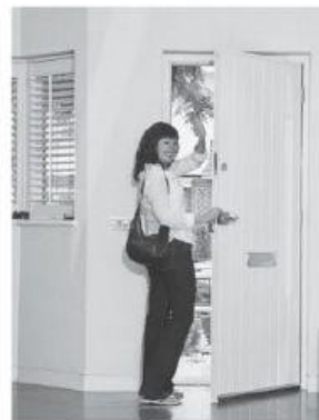
3 l _ _ _ the house