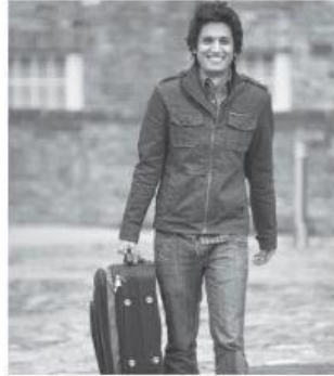
9 c _ _ _ a suitcase