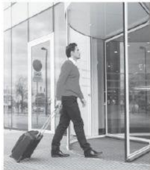
11 a _ _ _ _ at a hotel