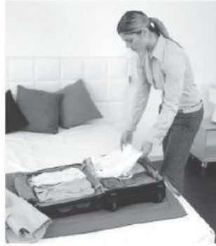
7 p _ _ _ a suitcase