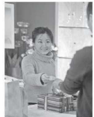
4 b _ _ presents