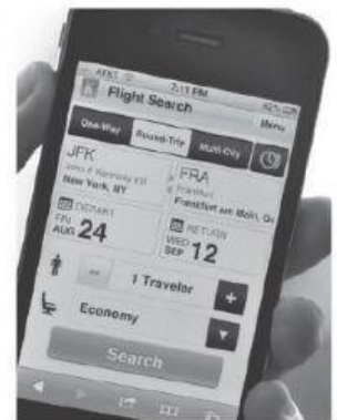
2 b _ _ tickets