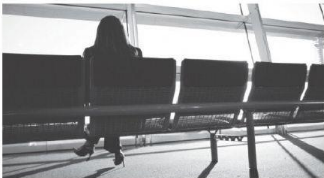
12 w _ _ _ for a flight