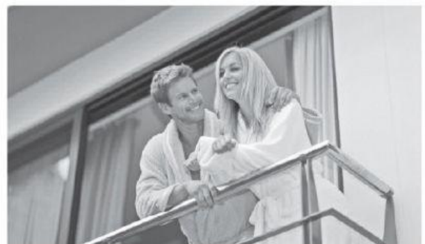
5 st _ _ in a hotel