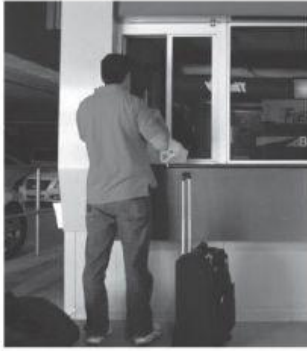
6 r _ _ _ a car