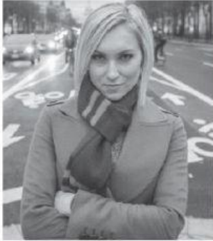
8 w _ _ _ a coat