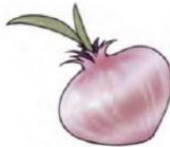
5 a / an onion