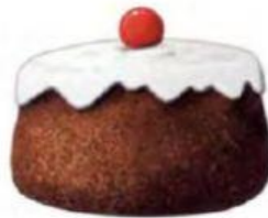
2 a / an cake