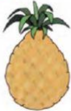
4 a / an pineapple