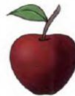
3 a / an apple