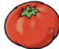
6 a / an tomato