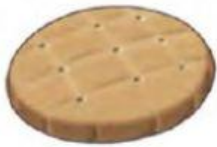
1 a / an biscuit