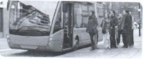
4 I travelled by bus last month.