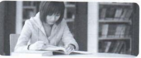
5 I read a book last year.