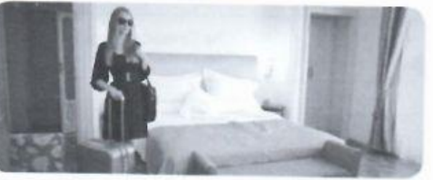
6 I stayed in a hotel last summer.