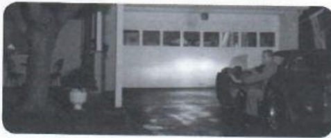
2 I sat on a bench last week.