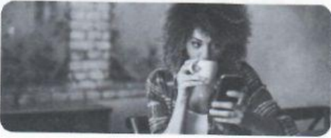
3 I checked my phone last night.