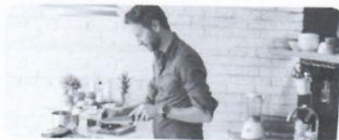
1 I cooked dinner last night.

arrive home late check emails cook dinner stay in a hotel study for an exam travel by bus