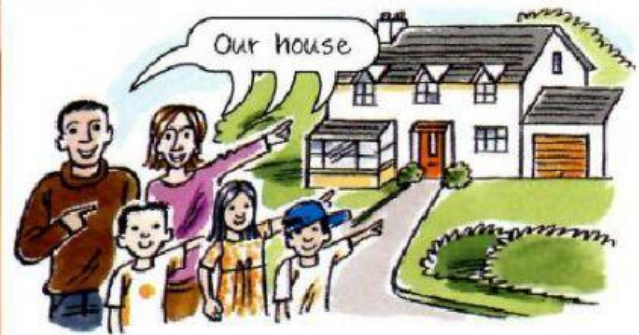
my friends' house = two or more friends

Look at the family tree. Complete the sentences about the people in the family. (Completar usando el posesivo con 's o el nombre que falte en la oración)