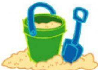
bucket and spade