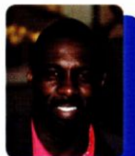
Idris Elba actor