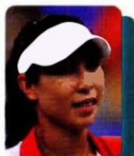
Zheng Jie athlete