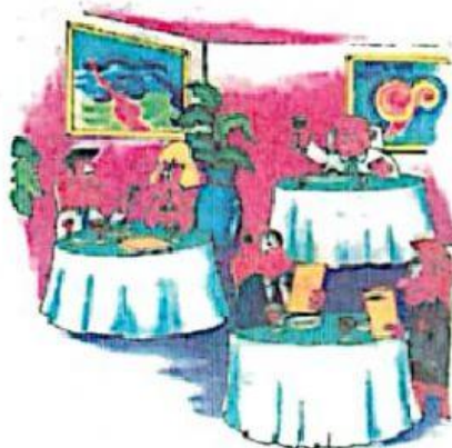
This is a restaurant.