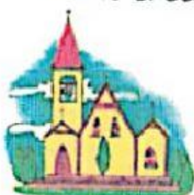
That is a church.