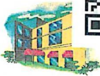
That is a hotel.