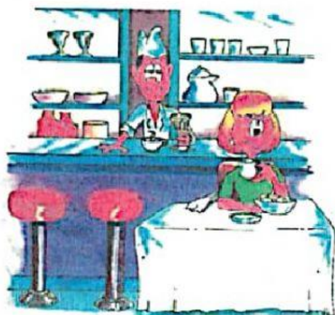
This is a cafeteria.