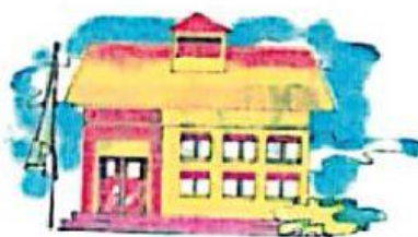
That is a school.