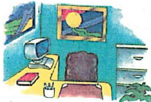
This is an office.