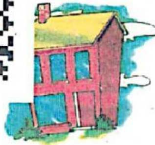
That is a house.