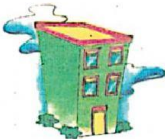
That is a building.