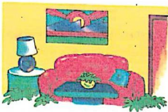
This is an apartment.