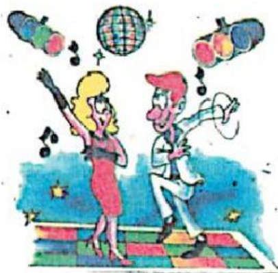
This is a discotheque.