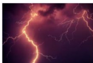
Lightening & Thunder

Which was a kind of weather was discussed in the book?