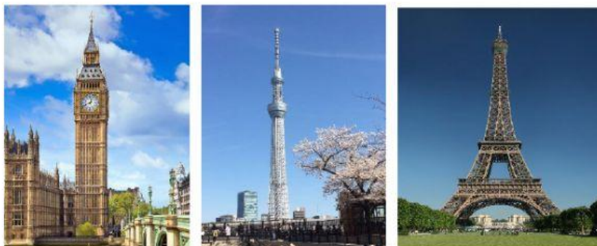
The Big Ben (96m)

c) Empire State Building is _____. (new)