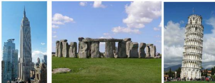
Empire State Building (1930)

a) Danyang-Kunshan Grand Bridge is _____ in the world. (long)