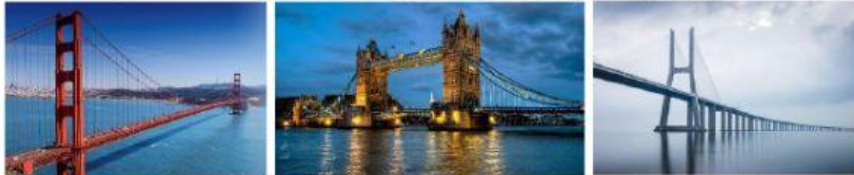
Golden Gate Bridge (2.737 m)

1. Observe the images and use the superlative to complete the sentences below: