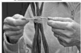
4 t _____