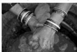
1 d _____