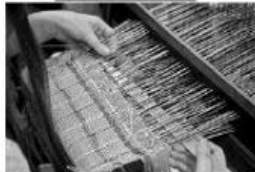
5 w _____

5 – Use RELATIVE PRONOUNS to complete the sentences: