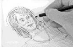
3 s _____