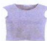
7. sleeve _____