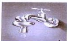
1. water _____

II. Complete the words under the pictures with -ful or -less , then mark the stressed syllable in each word. Say the words aloud.