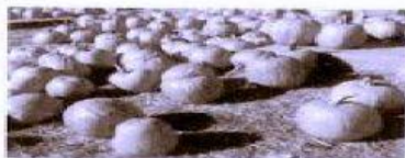
2. plenti _____