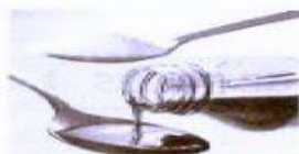
6. teaspoon _____