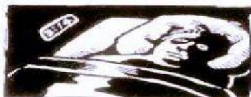
5. sleep _____