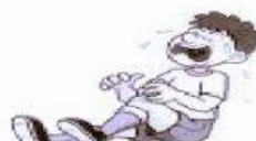
8. pain _____