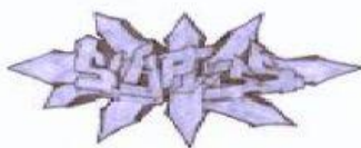
3. shape _____