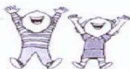
4. joy _____