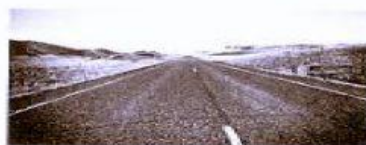
9. end _____