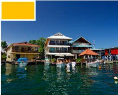
BOCAS DEL TORO ISLAND