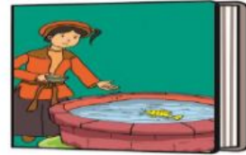
The story of Tam and Cam

Example: It's a fairy tale about two sisters.