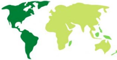
ocean / water