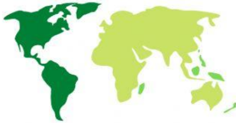
ocean / water