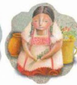
4 kneel / limp