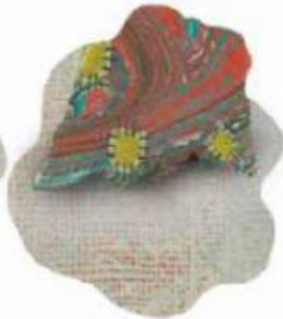
2 jolt / tattered