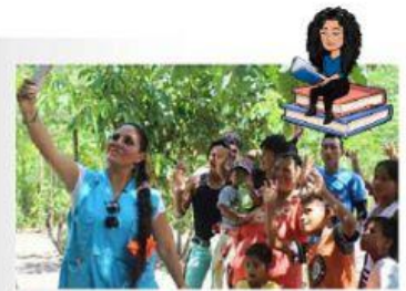
Dina Paucar is a singer and songwriter from Tingo Maria.

She is a very successful Peruvian musician. She speaks Spanish and Quechua and produces beautiful Andean music. She is very popular in Peru and other countries of the world. Dina knows that we need to promote our culture. She says: You can't ignore your culture; you can play traditional music to promote cultural diversity. Our music is incredible! Dina's music is an inspiration and we are very proud of her.