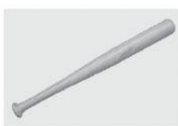
bat / ball