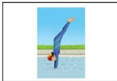
learn how to dive