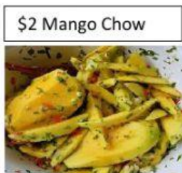
$2 Mango Chow