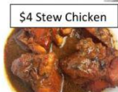
$4 Stew Chicken