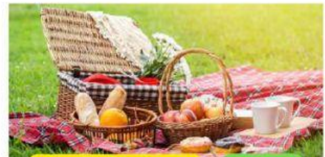
Regent's Park £5.00