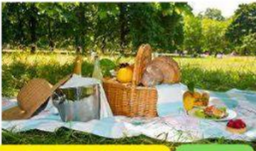
St. James' Park £5.00