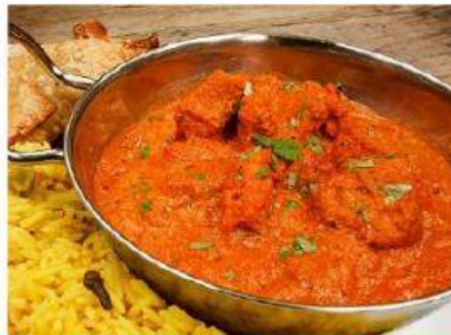
Chicken Tikka Masala £7.50