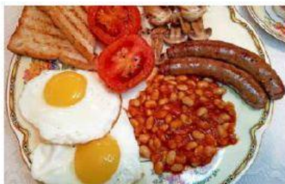
English Breakfast £6.50