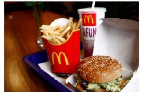
Big Mac Meal £6.50