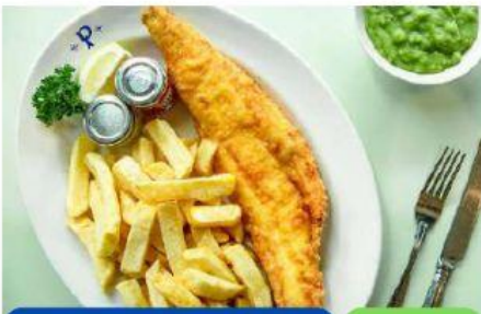
Fish and Chips £5.50