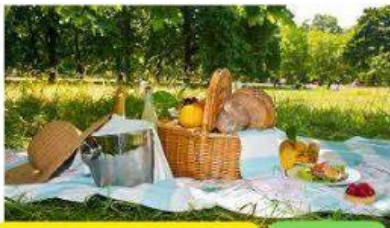
St. James' Park £5.00