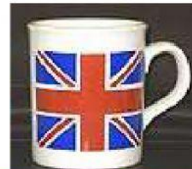
Flag Mug £1.50