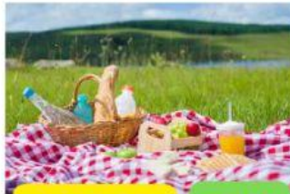
Hyde Park £5.00