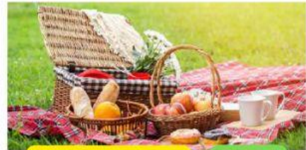
Regent's Park £5.00