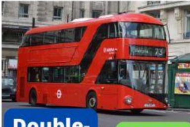
Double- Decker Bus