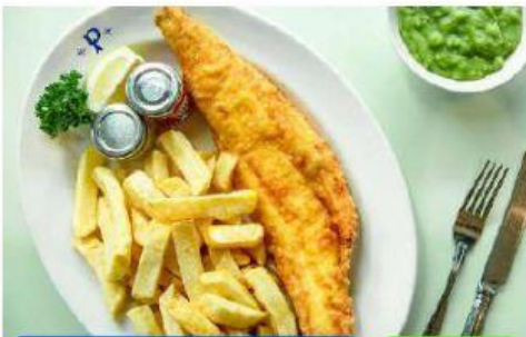
Fish and Chips £5.50