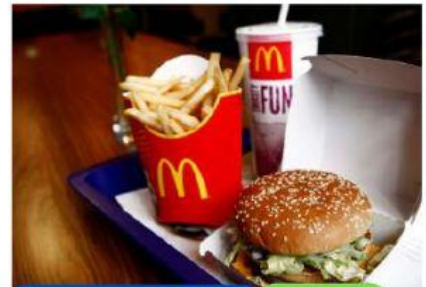
Big Mac Meal £6.50