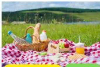
Hyde Park £5.00