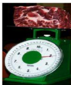
Two _____ of meat