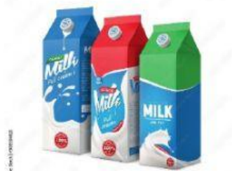
Three _____ of milk