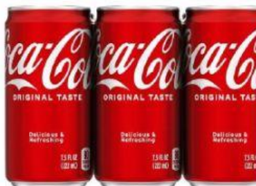
Three _____ of coke