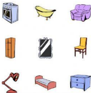
Nine _____ of furniture