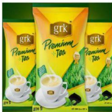
Three _____ of tea