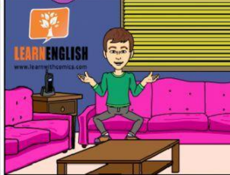
Figure 1 The past continuous story.

NOW I AM WAITING FOR MY FRIEND. WE WILL GO TO THE PARK TO PLAY FOOTBALL TOGETHER. I INJURED MY KNEE WHILE I WAS PLAYING FOOTBALL LAST WEEK BUT IT IS OKAY NOW. MY TEAM NEEDS ME!