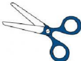
Lever - Scissors