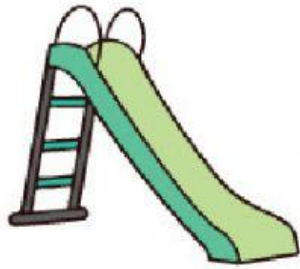
Inclined Plane - Slide