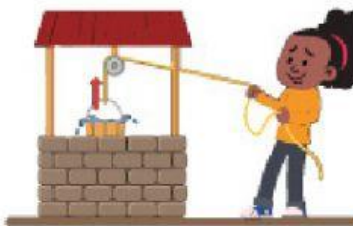
Pulley - Water Well