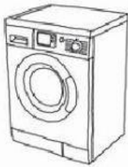
Engine - Washing machine