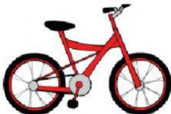
Wheel and Axle - Bicycle