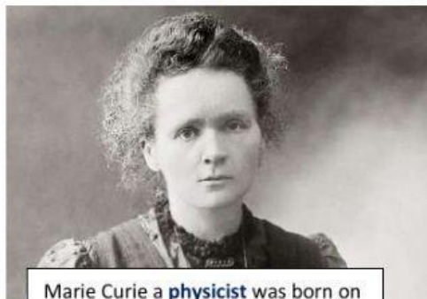
Marie Curie a physicist was born on _____, Warsaw, Poland.