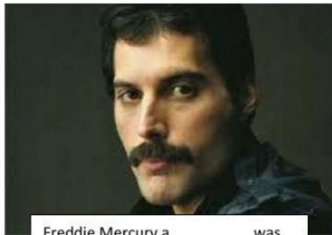
Freddie Mercury a _____ was born on _____, Stone Town, Tanzania.