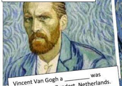
Vincent Van Gogh a _____ was born in _____, Zundert, Netherlands.