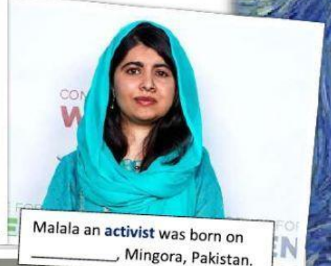
Malala an activist was born on _____, Mingora, Pakistan.