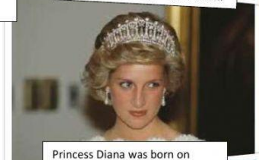
Princess Diana was born on _____.

Listen and write the missing information.