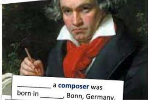
_____ a composer was born in _____, Bonn, Germany.