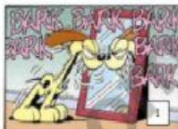
begin to bark