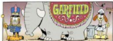
Garfield and Odie

LOOK AT WHAT HAPPENED TO GARFIELD AND ODIE, YESTERDAY. PUT THE PICTURES IN THE CORRECT ORDER AND TELL A STORY. USE THE PAST SIMPLE TENSE.