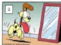
pass by a mirror