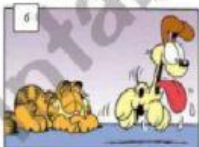
fall asleep / go play with his bone