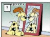
see his face in the mirror / start to growl