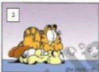
jump on top of Odie / make him stop barking