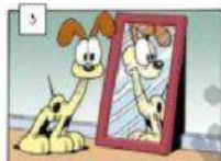
he hears someone coming