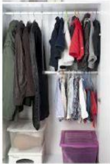
18. The bar of a cupboard