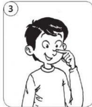
nose / noses