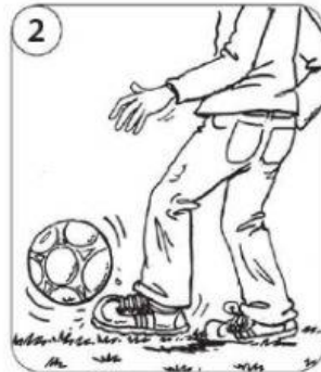
leg / legs