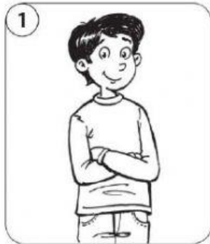
arm / arms