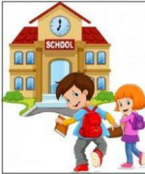
go to school