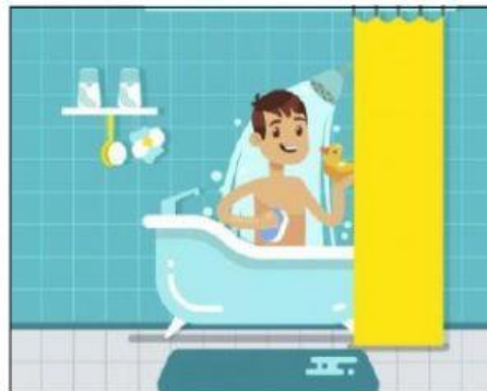
take a bath