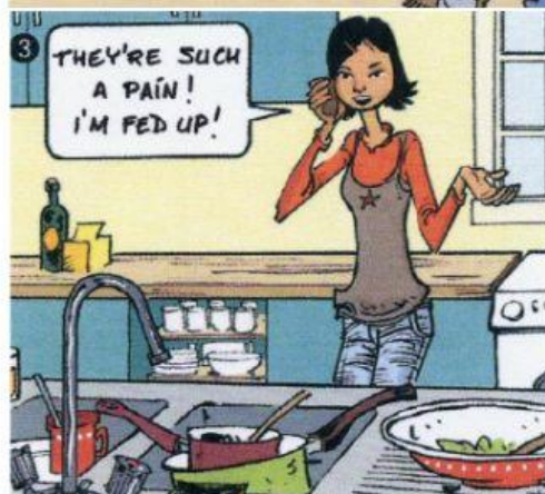
Picture 1- Conversation number