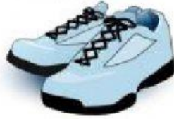
Putting on shoes