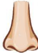
3. Nose: mũi