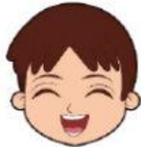
1. Face: mặt