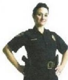
2. police officer