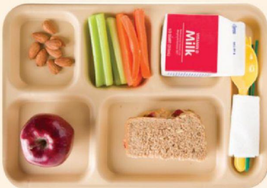
A school lunch of a sandwich, milk, carrots, celery, nuts, and an apple

Children don't have to eat the school lunch. They can bring a lunch from home.