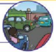
Transport to School