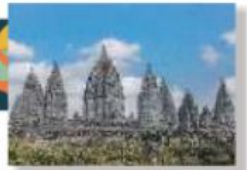
Prambanan Temple, (DIY) Yogyakarta

1. Write the name of these famous place and structures. What city are they in?