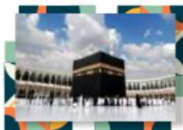
Magnificent, Safe, Amazing, Cultural