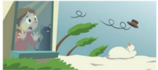
4 Sunday afternoon