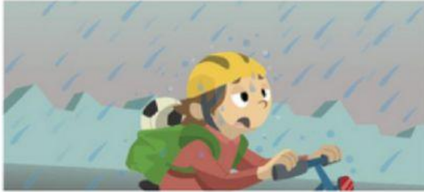
1 Saturday morning

rainbow cloudy snowed windy rained sunny