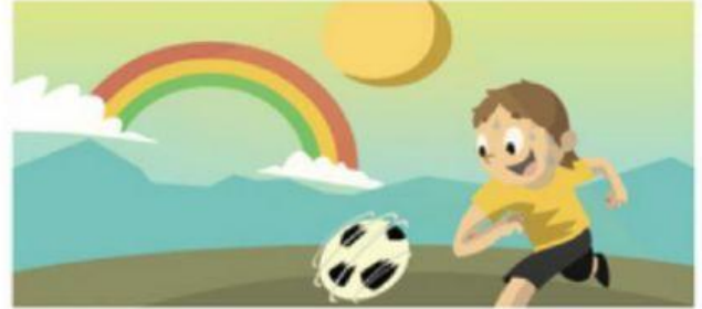
2 Saturday afternoon