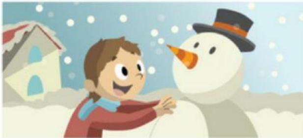
3 Sunday morning