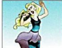
a pop star