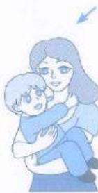
my mother/ thirty-five