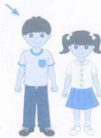
my brother/ eleven