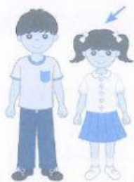
my sister/ nine