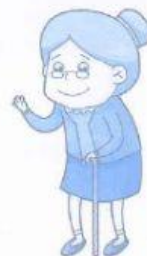
my grandmother/ seventy