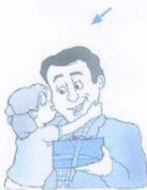
my father/ forty